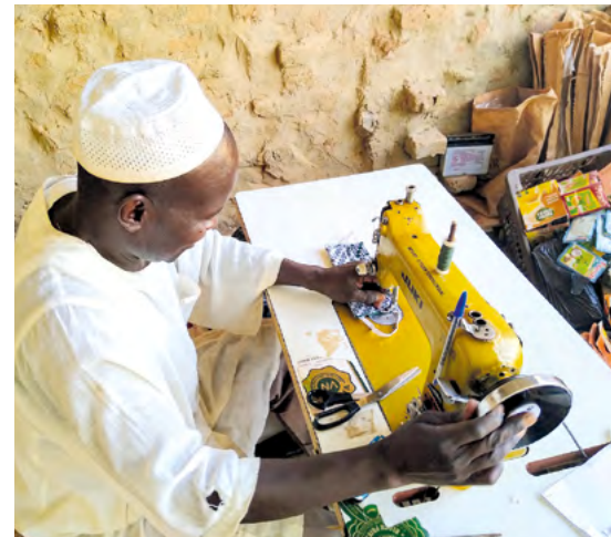
Production of fabric masks

The village clinics had only very limited information and no means at their disposal to fight the new disease. Usually, a doctor, some midwives and assistants work in these clinics. SAS visited every village clinic in the surrounding area. In the process, masks, a memory card with the video and printed posters, which explain the pre-