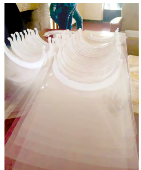
Production of the face shields