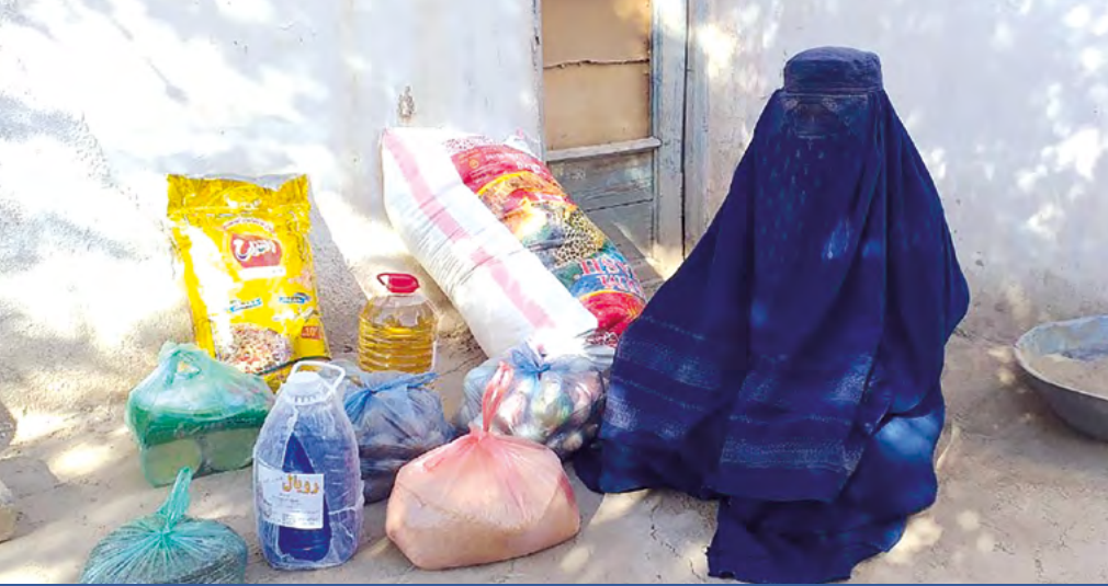
Great gratitude, although it is not visible