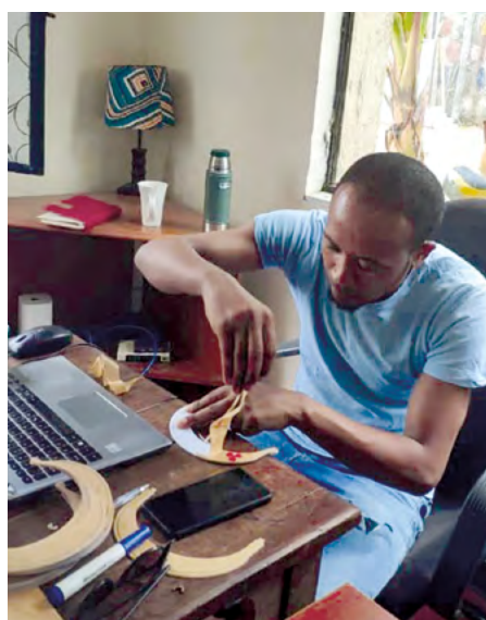
Necessity is the mother of invention