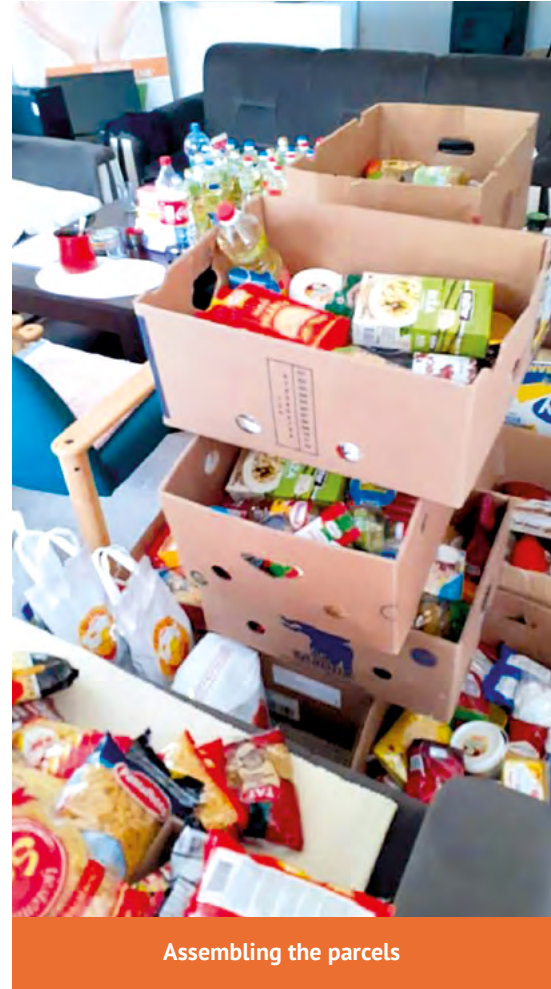
Assembling the parcels

“The distribution of the food parcels was both a joy and a challenge at the same time. We encountered conditions, which we find difficult to imagine in our country. I’m thinking of a couple with ten children: there was no more food in the house and the children were hungry. The father was ashamed that he couldn’t support his family