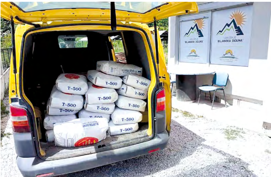
Transport to Han Bila

any more. There was despair and lack of perspective”, says our collaborator. “With your donation, we were able to help. The people here are very grateful for this blessing and happy about it. It helps them to move on and to look forward with the experience that they are not alone! A better future is possible because there are others who commit themselves for places where faith had been lost.”