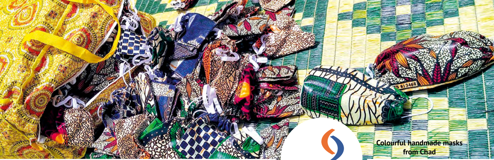
Colourful handmade masks from Chad